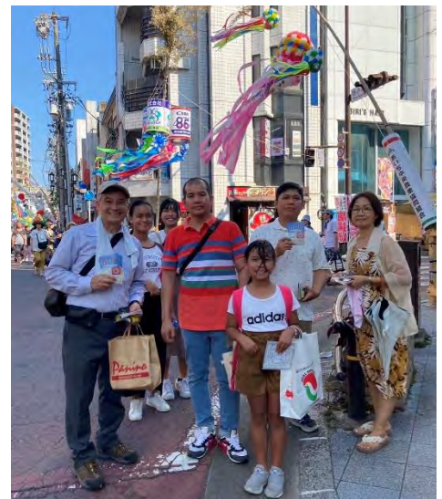
Passing out tracts at the Tanabata Festival

In August, the city of Anjo had their annual Tanabata Festival. It is a 2-3 day festival celebrating two pagan (star) gods. The streets are lined with food booths, music performers, festival dancers in traditional costumes, etc. People from surrounding areas come to the festival and over a million people attend the event. We had ten people from our church pass out tracts and be a witness for Jesus Christ. More people took tracts than expected. Some of the older people took tracts from our young people and it seemed like middle school students were more open to taking tracts and talking about eternity. (If one person in the group took a tract, then all of them would be willing to receive one and vice versa.)