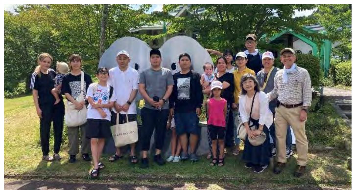
Church summer camp / August 2024