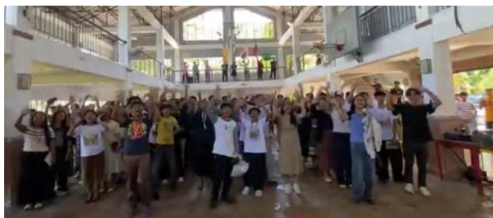
Youth Camp hosted by Bible Believers Baptist Church, Bulacan, Philippines

The openness of the people to the gospel was something I had to get used to of and was truly a blessing. I experienced many friendly people, smiling and conversing as they went about their daily life... many in the midst of poverty which was hard to see.