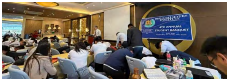
Preaching at the bible school banquet.

Here in Japan...Our Resurrection Sunday service and luncheon afterwards went well. There has been a noticeable difference in our congregational singing over the last couple of months which brings me great joy! While I was in the Philippines, we had three young men helping with the services. Two of them are taking Bible classes and seeing them take part in song leading, teaching what they are learning, and giving testimonies has been real encouraging.