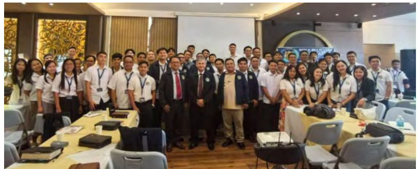
Banquet: Bible Believers Institute Metro Manila, Philippines