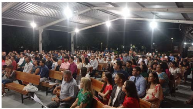
Record number of Campers!!!