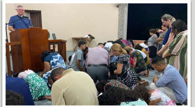
Getting right with the Lord!!!