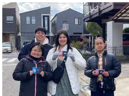
Passing out Chick tracts in the neighborhood.