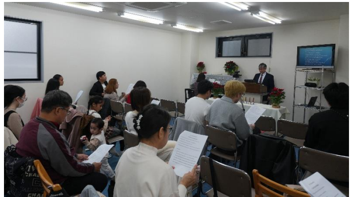
Service in our new church facility.