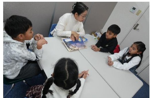
Sunday School kids